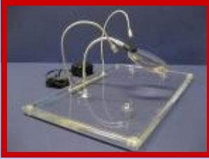
Cat#: ASS7 AIMS Standard Surgery Platform