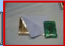
Cat#: GPRU AIMS Gel Pad Activation Unit-Sanyo Steamer